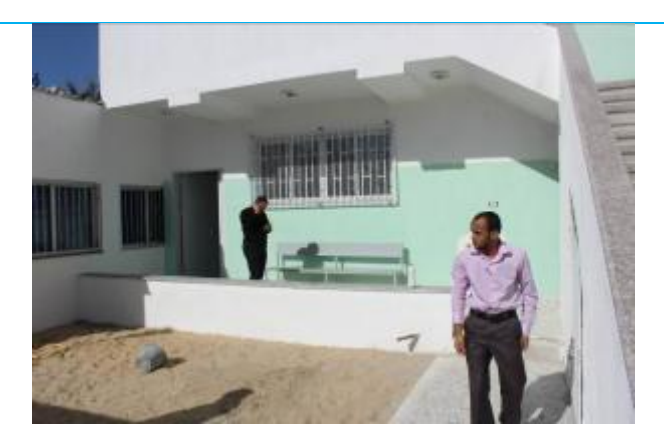
External view for the constructed building