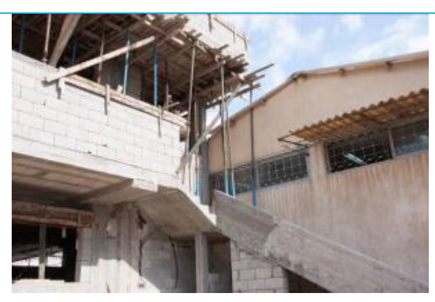
The new building was constructed