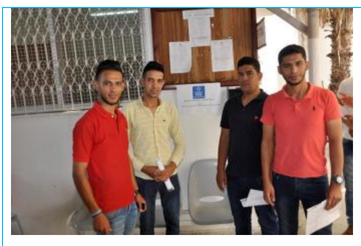
Applying for the job creation opportunity

Photos for the follow-up of graduates in their job places.