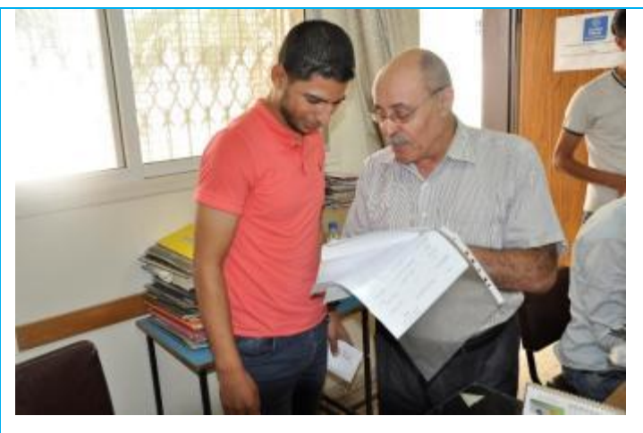
Applying for the job creation opportunity