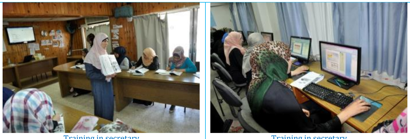
Training in secretary