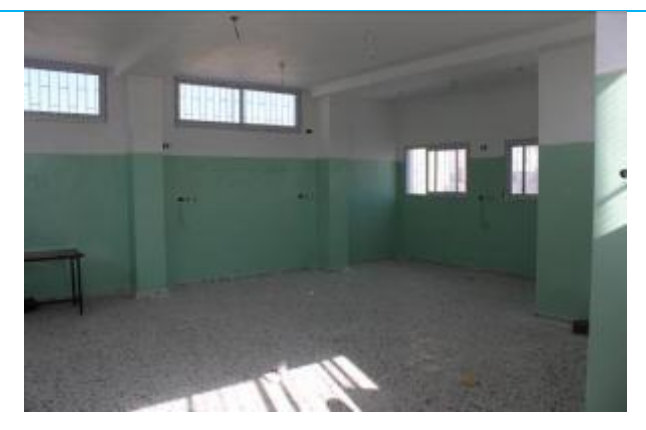
Interior painting works finished