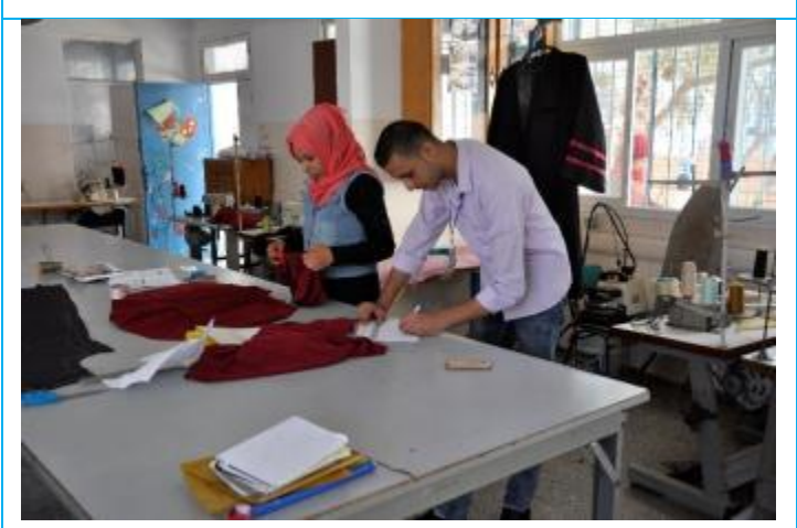
Follow-up visit by the social worker